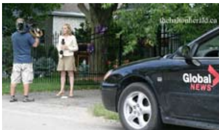
Local story gets national attention.