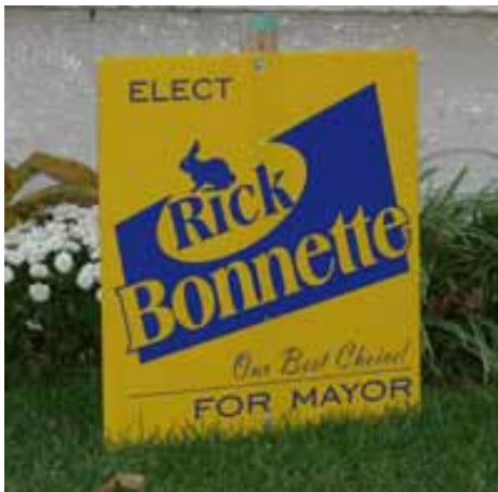
Bonnette's recent campaign sign